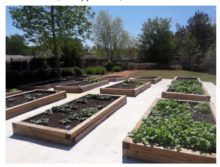
Photo of the community gardens at Mercy's property, the Hills at Fairington in Lithonia, GA.

The initiative launched on April 30, 2016. Mercy Housing will be working with the